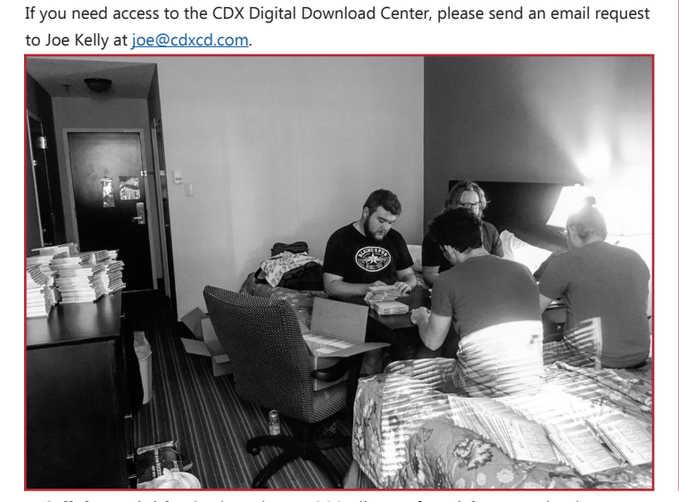
Callahan Divide signing almost 300 albums for Kickstarter backers and radio for their release this Friday of Poplar .