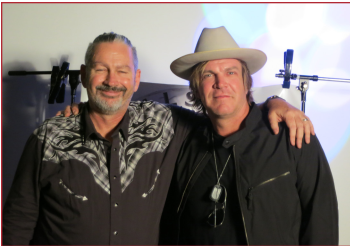
Chucks always come in pairs! Chuck Taylor with Jack Ingram live remote from AmericanaFest!