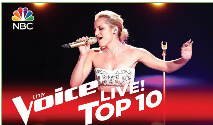
"Congrats on making it into the Top 10 ! You are country's Voice . Keep up the amazing work!!" #teammarysarah #teamblake